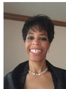
St. Philip's, Richmond

With them we are guaranteed to have a confident, assertive and active voice in the selection of the 14th Bishop of the Diocese of VA!